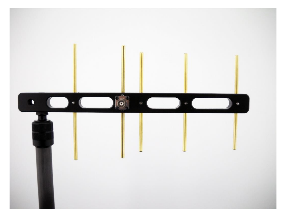
This Photo shows Vertical Polarization of the antenna. Use this mounting polarization for most applications.