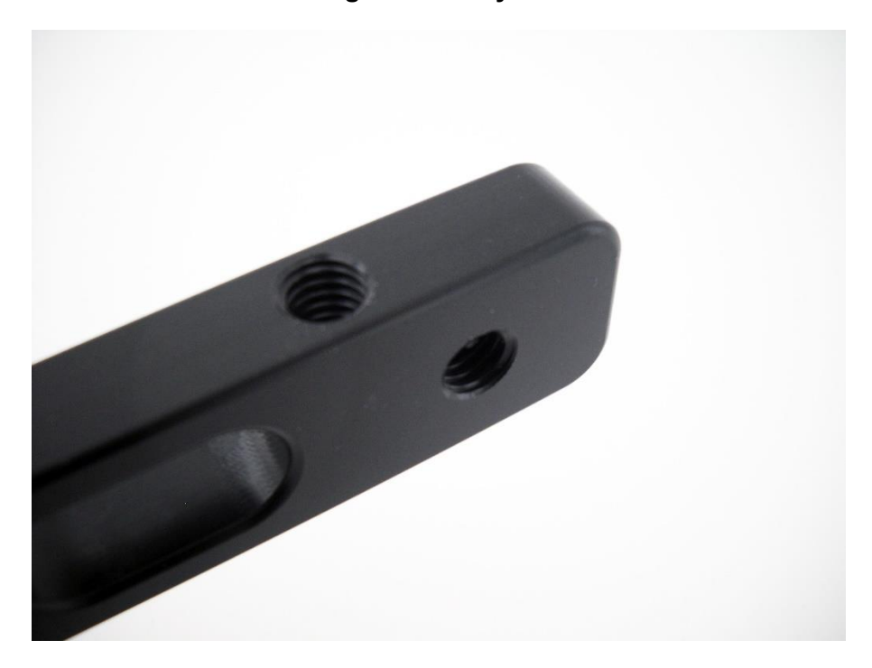
This photo shows the 3/8-16 TPI mounting threads.

The antenna can be mounted using an industry standard 3/8"-16TPI threaded base.