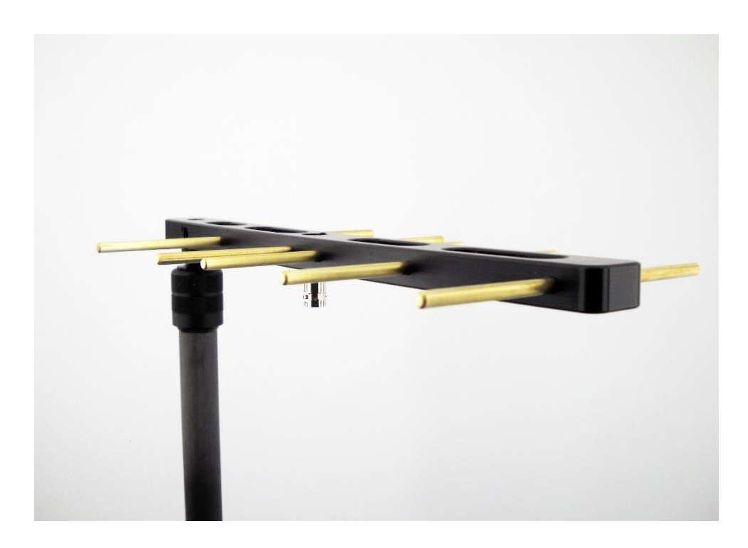
This photo shows Horizontal Polarization of the antenna. This mounting position is used when the transmitter's antenna is also mounted horizontally.